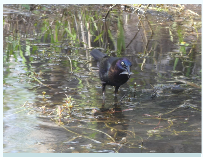
A Common Grackle preying on fish in Big Cypress National Preserve. March 18 2023.

While learned problem-solving skills among wild birds are best known among the crow family, one can never rule out the capacity of other kinds of birds to also acquire novel learned behaviors. While on an excursion with a companion on Loop Rd. in Big Cypress National Preserve this spring, I discovered that members of the blackbird family also have this potential. At stops along a few of the culverts under the road. I would notice a small flock of Common Grackles with some space in between each other, each foraging right along the water's edge. When I looked closer, I saw that they were periodically dipping their open beaks into the water as they walked, and then, one of them caught a small fish! It was then that I realized they were using the exact foraging behavior as the much bigger Wood Stork. Given that the water was lower when we visited and we did see a few storks along the road as well, it is very likely that some of the grackles could have watched how the storks fished under the proper conditions over the years, and from there learned the behavior and even shared it with their network. Just as likely, some grackles could have observed the behavior from outside the preserve and then applied the technique to the culverts in turn as they moved around the area. While I do not know for how long the grackles of Big Cypress have adapted this foraging strategy, it is yet another example of how