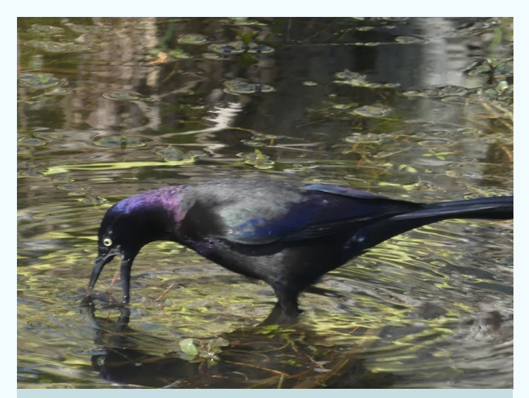
A Common Grackle preying on fish in Big Cypress National Preserve.